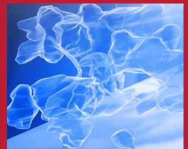
Three-dimensional distribution of dark matter in the Universe